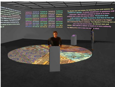
Fig. 1 2008 Proposal 1. Texts in five rows with kiosk touch screen and projecting on wall. Drawing ©Nina Yankowitz

Text would dynamically load into each of the five columns from one external XML file. The Flash based interactive presentation (elements-interface-items-controls) allows users to click and highlight a particular quote from five pre-tagged color coded words viewed in the middle of the screen--LOVE, DEATH, MAN, WOMAN, OBEDIENCE. Participant selections appear in the (sixth) empty column. Each text in the sixth column will retain the color of the original column from which it came. When finished, the user would be prompted to save the selections. When "SAVE" is selected, the final list of color-coded quotes will appear in the middle of the screen. Players can option to export text projections to a computer at a specific public location somewhere displaying their selections sited on interior walls, exterior facades, museums, or public buildings.