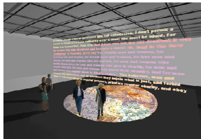
Fig. 2. People read virtual texts floating in space. Drawing ©Nina Yankowitz

We discarded it in 2008 due to space limitations and funding restrictions